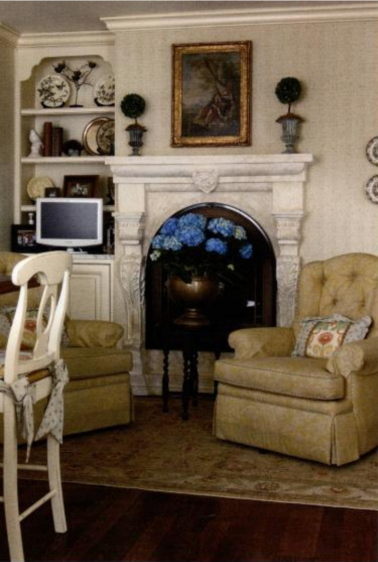
Above: A cozy seating area at one end of the kitchen is a favorite place for the family to gather. Right: China cabinets with beveled glass upper doors frame the view into the breakfast room.

and wallpaper, and Edin Maslo of Delta Construction for the scagliola fireplace surround (an ancient technique using recomposed limestone).